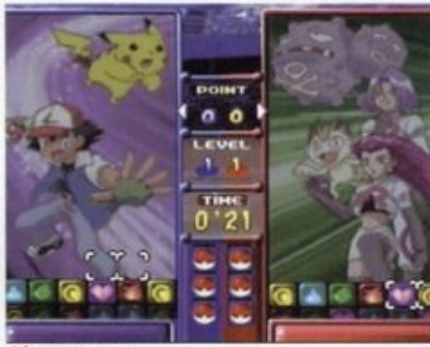
POKEMON PUZZLE LEAGUE Get out your wallet.