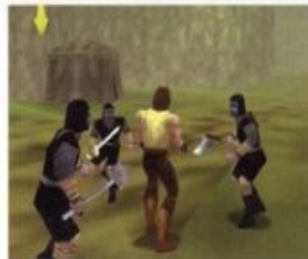
HERCULES Beat 'em up.