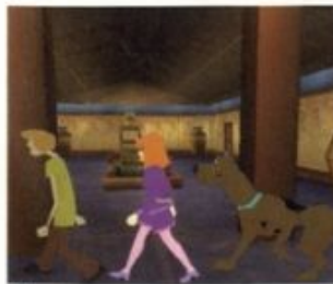
SCOOBY DOO Just like the show!