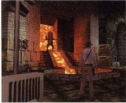
INDIANA JONES AND THE INFERNAL MACHINE