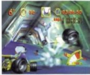
MICKEY'S SPEEDWAY Karts...