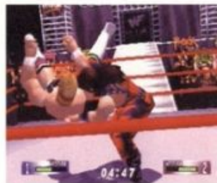
WWF: WRESTLEMANIA 2000