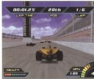
INDY RACING 2000 Fast cars.