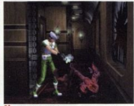
RESIDENT EVIL 0 This looked really good!