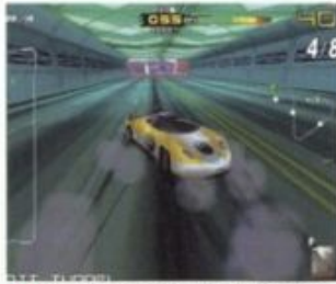
SAN FRANCISCO RUSH 2049