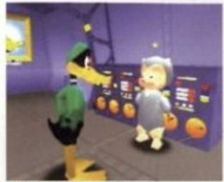
DUCK DODGERS Looney, baby.