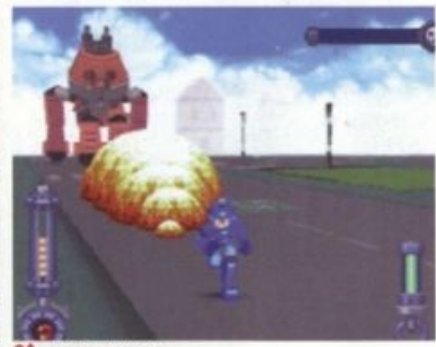
MEGAMAN 64 The classic MegaMan returns!