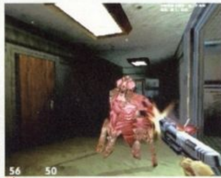
TUROK 3 Third time around for this shooter...