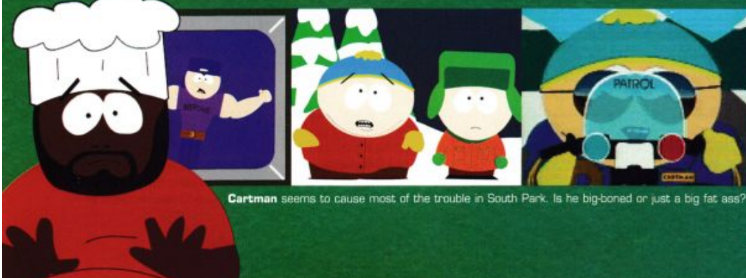
Cartman seems to cause most of the trouble in South Park. Is he big-boned or just a big fat ass?