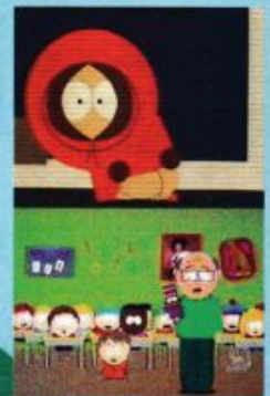
The two faces of Kenny very rarely seen