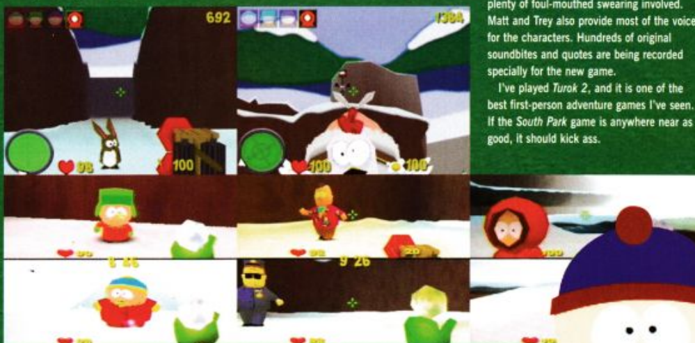
The plain colour texture maps mean that even in split screen mode, the game should still run smoothly

I've played Turok 2 , and it is one of the best first-person adventure games I've seen. If the South Park game is anywhere near as good, it should kick ass.