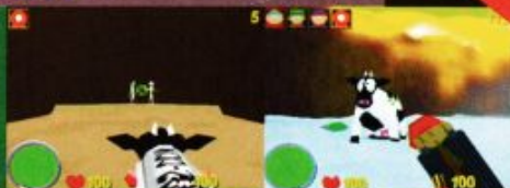
The cows are most definitely not sacred in South Park

To help you win the day you have a selection of bizarre South Park-style weapons and gadgets, such as the Cow Launcher, the Fat