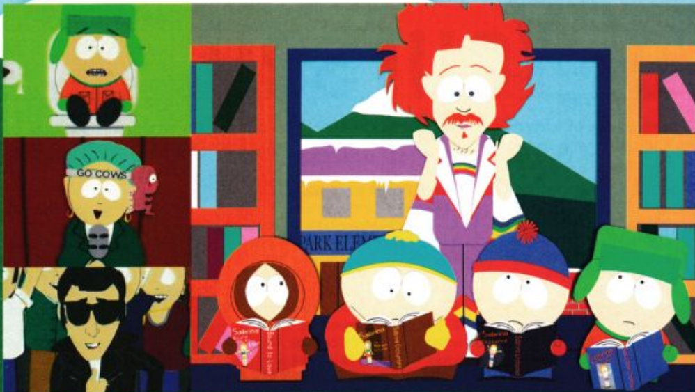
George Clooney was Stan's gay dog, Issac Hayes plays Chef, Robert Smith saved the town, and is that Henry Winkler on the left?