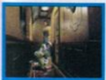
▲ This was the only N64 game of note at the show – however, it does look pretty darn superb!