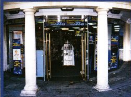
Fancy a brand-new game? MVC sells 'em cheaper than elsewhere. Provided you're a member.

Ostensibly a music and video store, MVC offers free club membership. Members get money lopped off, well, pretty much everything and as far as games are concerned, this can be between a couple of quid and a fiver. Very nice indeed.