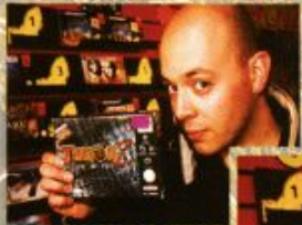
△ Friendly staff and plenty o' bargains. Classy indeed.